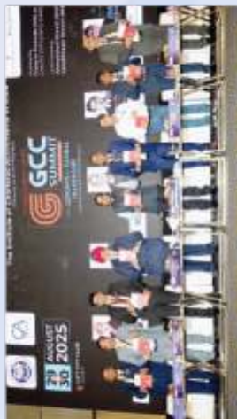
Infrastructure makes it an attractive base for innovation-driven GCCs.

as the destination of choice for GCCs, particularly in finance and accounting. ICAI's proactive partnerships with government and institutional stakeholders were also highlighted. Collaborations with the Department of Commerce, the Ministry of Electronics and Information Technology (MeitY), the Ministry of External Affairs (MEA), the International Financial Services Centres Authority (IFSCA), and Invest India are helping to create an enabling ecosystem.