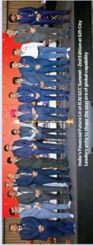
India's Financial Future Lit at ICAI GCC Summit - 2nd Edition at GIFT City Leaders unite to shape the next era of global capability

For two days, the summit brought together industry experts, policymakers, foreign investors, and chartered accountants (CAs) to discuss how India is positioning itself as the premier global hub for financial, business, and innovation services. The event highlighted the strength of India's GCC