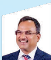
Shri Mahaveer Singhvi Jt. Secretary Ministry of External Affairs Government of India