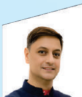
Shri Sanjeev Sanyal Member of the Economic Advisory Council to the Prime Minister