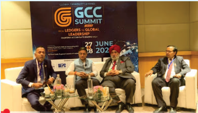
Shri Sanjeev Sanyal at GCC Summit 2025 | Reimaqinir