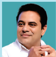
Shri Kalvakuntla Taraka Rama Rao (KTR) Former Minister Government of Telangana